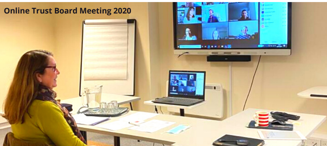
Online Trust Board Meeting 2020

“Our focus has been to sustain our services to children and families who even in ordinary times face many additional challenges.”