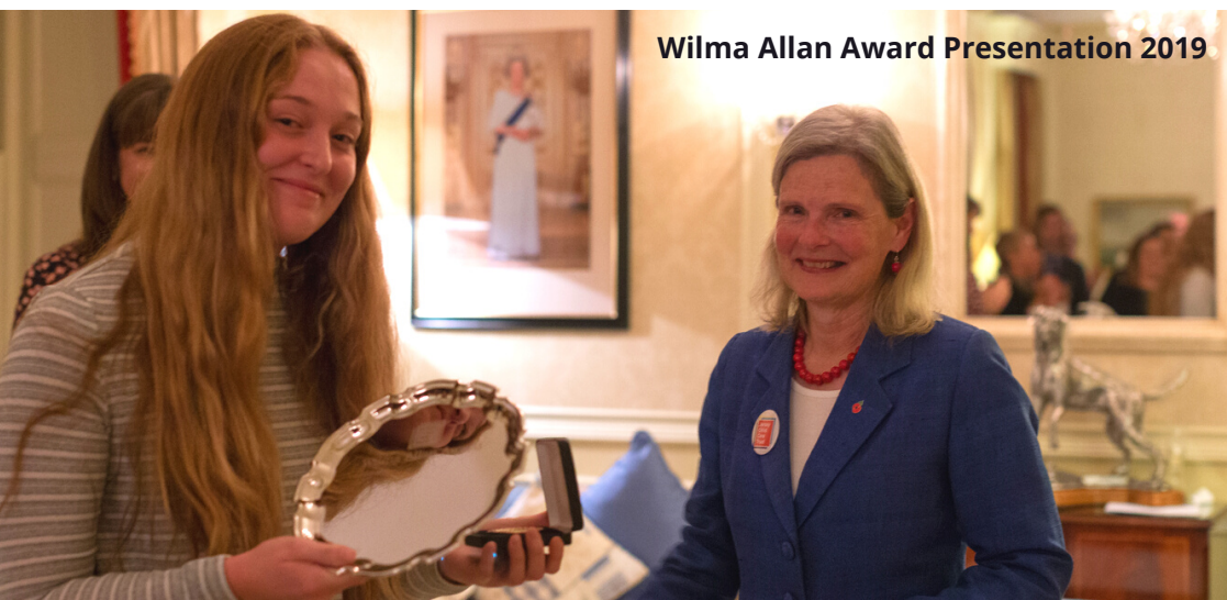
Wilma Allan Award Presentation 2019

“ Outstanding and wonderful staff ... and volunteers. ”